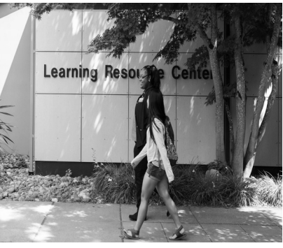
Students walking outside of the Learning Resource Center, Building 15.

The College does not provide or arrange housing or transportation for students. Several apartment complexes are located near the College campus. Arrangements for housing and transportation are the responsibility of the student.