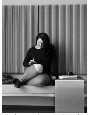
Student studying on bench.